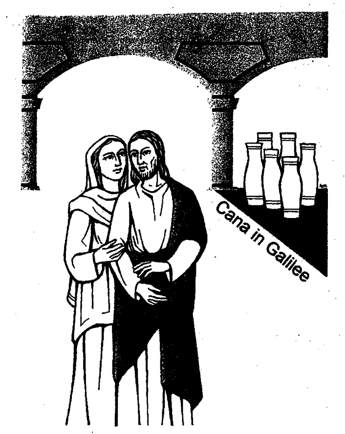
I would worry about that water, Son

The Association of Pittsburgh Priests Ph: 412-716-9750, POB 2106, Pgh 15230 Pax Christi Greensburg: Care of Creation Cmte Ph: 724-850-1616, senahuav@yahoo.com